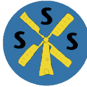
Shepeau Stow Primary School

Our Vision is to provide all members of the school community with the opportunities to engage with 'life in all its fullness' (John 10:10) by igniting imagination and curiosity which builds an enduring passion for life-long learning.