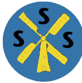
Shepeau Stow Primary School

Our Vision is to provide all members of the school community with the opportunities to engage with 'life in all its fullness' (John 10:10) by igniting imagination and curiosity which builds an enduring passion for life-long learning.